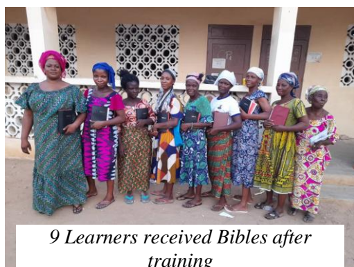
9 Learners received Bibles after training

Other classes have not been able to complete their first literacy booklet. Others are closed for lack of teachers or because of learner absenteeism. By 2023, we expect to have taught a total of 108 learners.